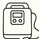
PORTABLE OXYGEN CONCENTRATOR

San Angelo's most experienced clinical staff, with a Board Certified Clinical Nurse Specialist, and a Certified Respiratory Therapist on staff for your continued medical needs!